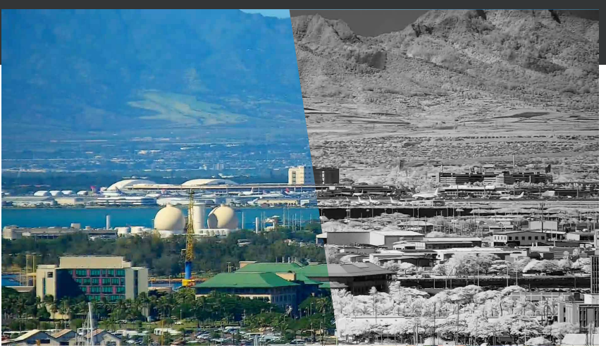
Standard Color Visible Image (Optical Fog Filter Disabled)