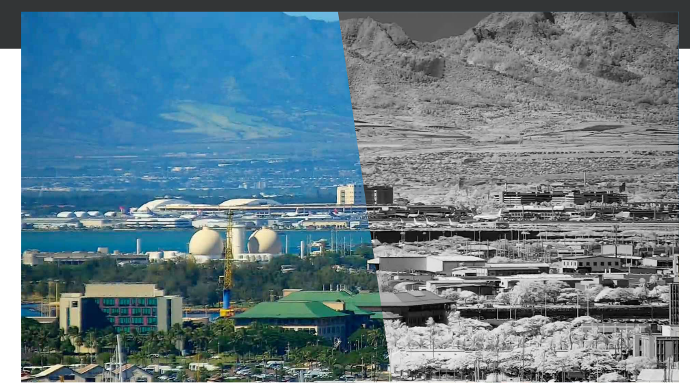
Standard Color Visible Image (Optical Fog Filter Disabled)

The Atlas's precision engineered IR-corrected zoom lenses are built with high quality optical glass and feature integrated rapid auto focus. We offer a wide range of focal lengths with zoom factors from 3X up to 30X optical zoom. At full zoom, our longest range 30X lens option has the equivalent field of view of a "full-frame" DSLR camera with a 950mm lens.