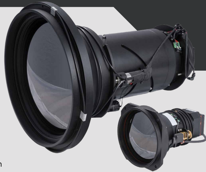
Physical size difference between a 310mm f/1.3 thermal lens and a 120mm f/1.4 thermal lens.

Long-range thermal lenses can experience focus shifts over time due to several factors related to thermal optics and environmental conditions. This is why Infiniti's thermal cores have a built-in autofocus timer to correct any shifts without the need for manual user intervention. This document explains the factors beyond our control that contribute to focus shifts, particularly in larger long-range lenses.